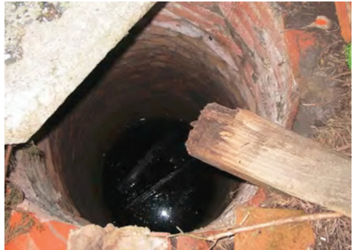
OPEN WELL CASING. Improperly abandoned wells can transmit contaminants from the surface into groundwater and can also be a safety hazard to people and animals. This open well casing is an example of an abandoned well that has not been properly filled and sealed.

A well is considered inactive if the owner demonstrates an intention for future use and the requirements for well maintenance are met.